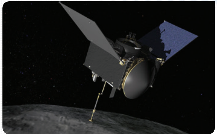
The OSIRIS-REx asteroid mission is tasked with capturing an asteroid sample for further analysis.